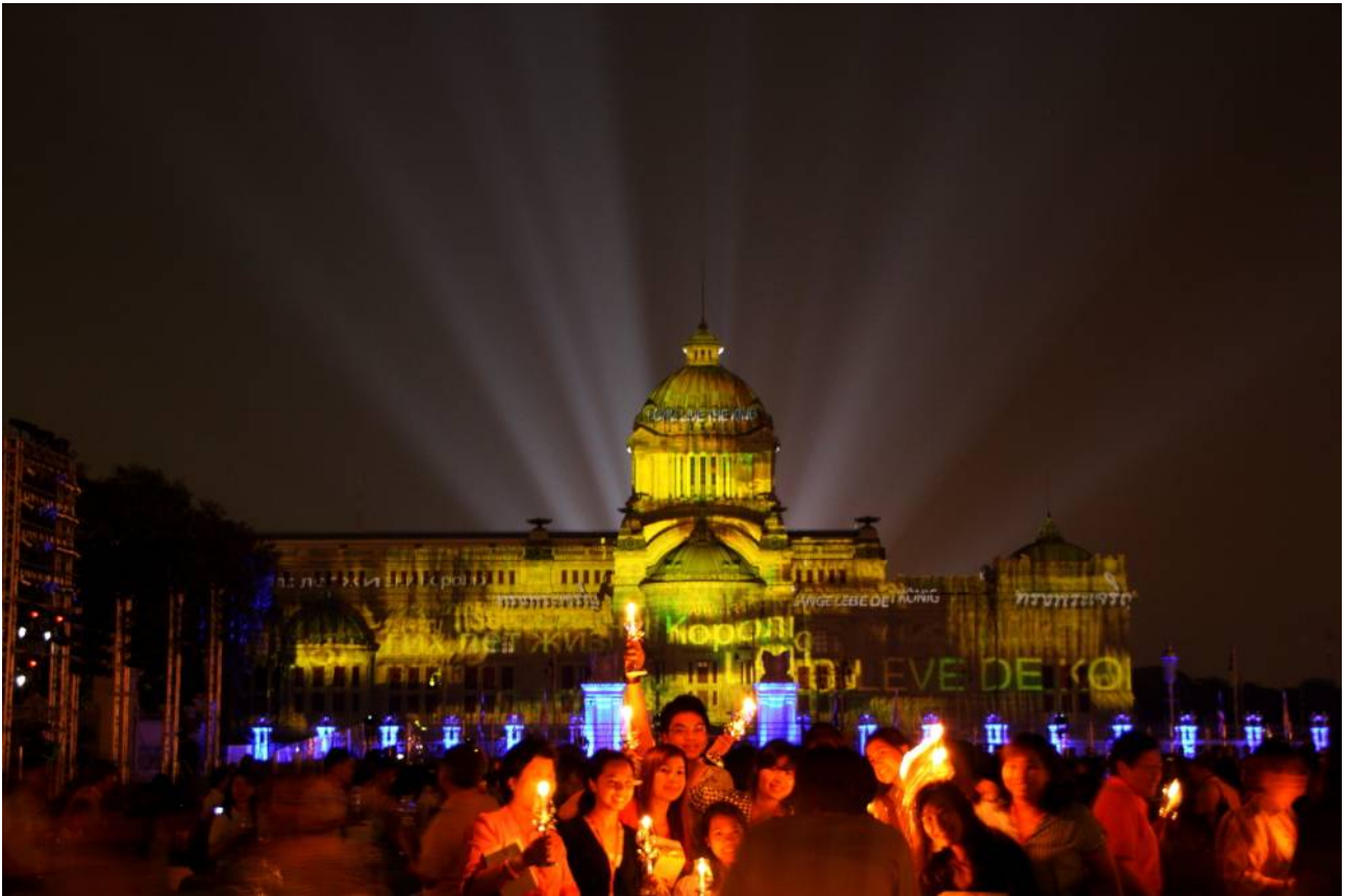
© 2009 VG Bild-Kunst Bonn Philipp Geist