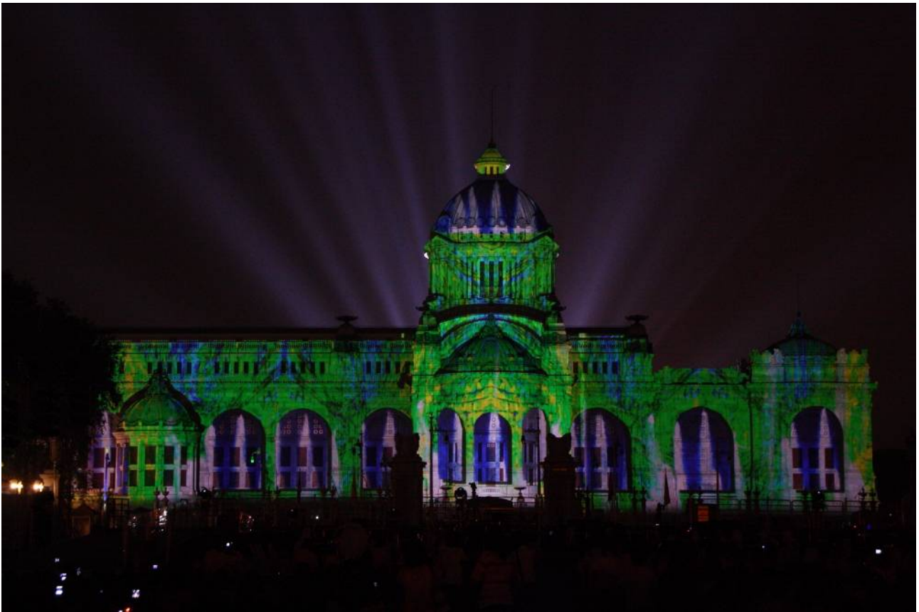
© 2009 VG Bild-Kunst Bonn Philipp Geist