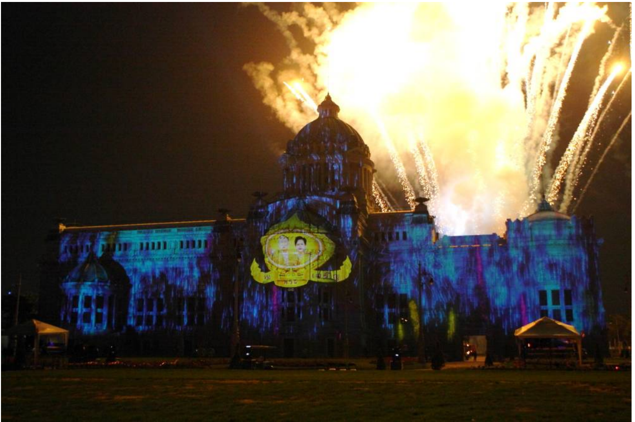
© 2009 VG Bild-Kunst Bonn Philipp Geist