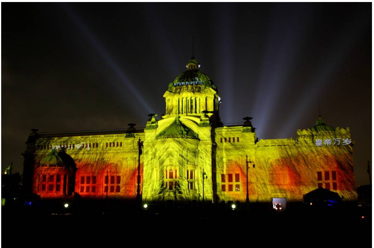
© 2009 VG Bild-Kunst Bonn Philipp Geist