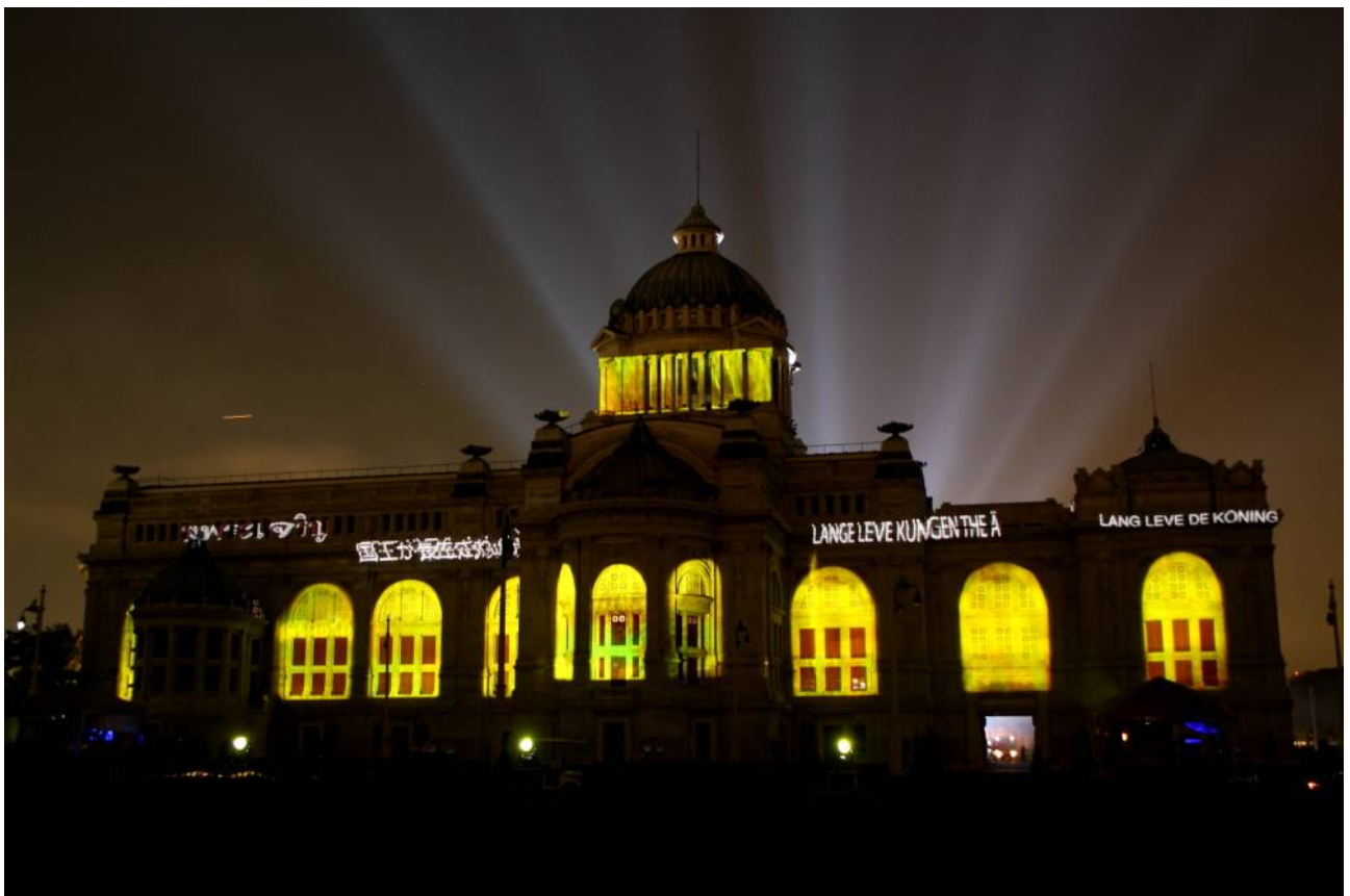
© 2009 VG Bild-Kunst Bonn Philipp Geist