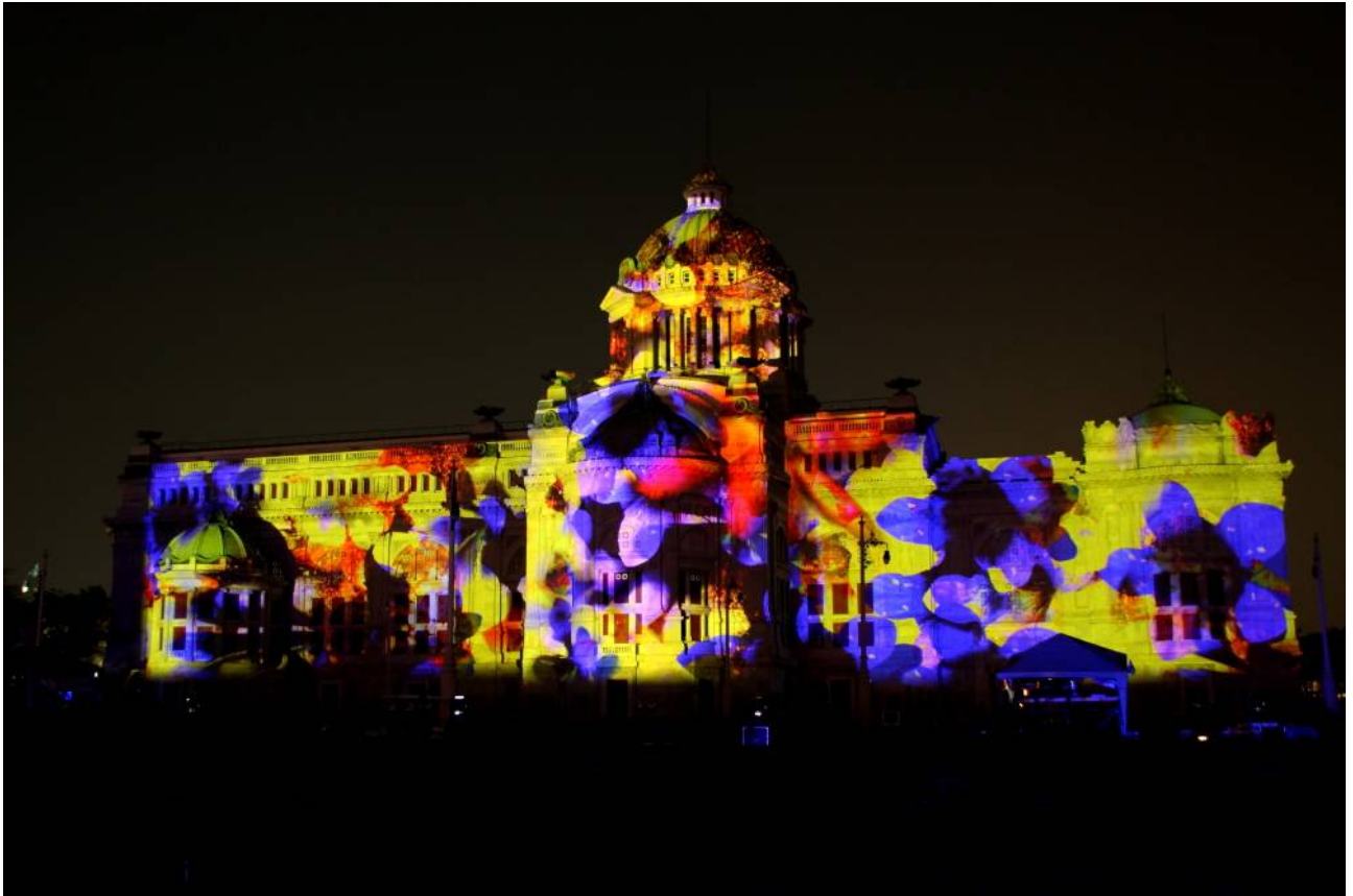
© 2009 VG Bild-Kunst Bonn Philipp Geist