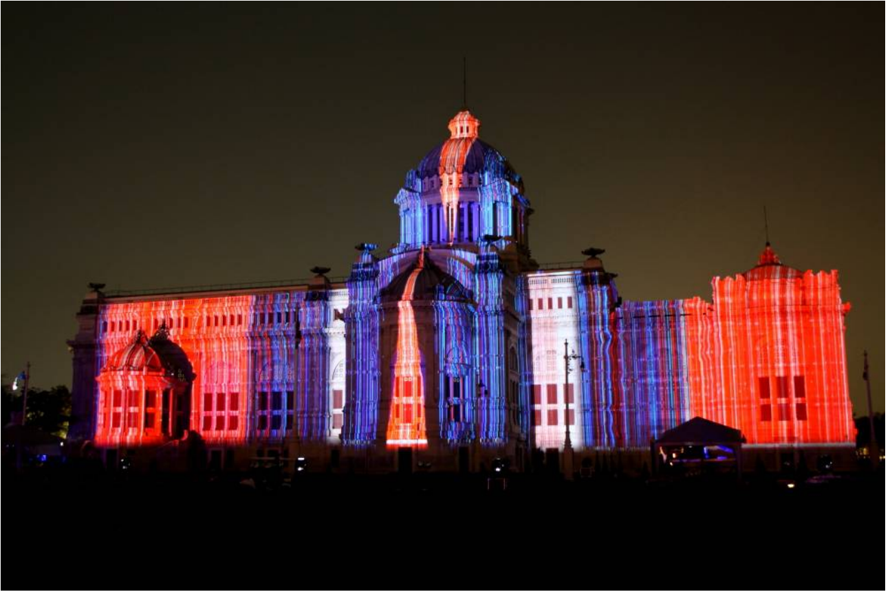
© 2009 VG Bild-Kunst Bonn Philipp Geist