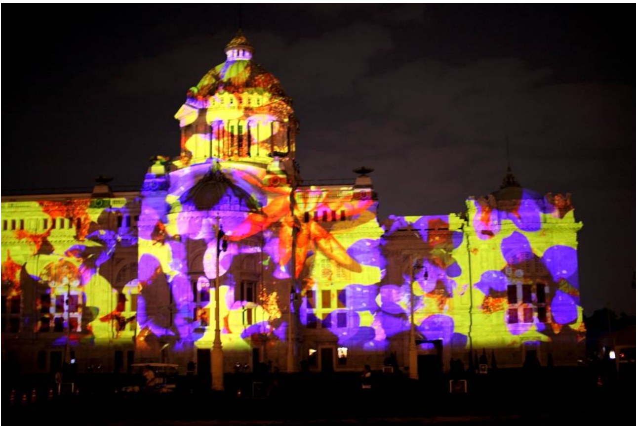
© 2009 VG Bild-Kunst Bonn Philipp Geist