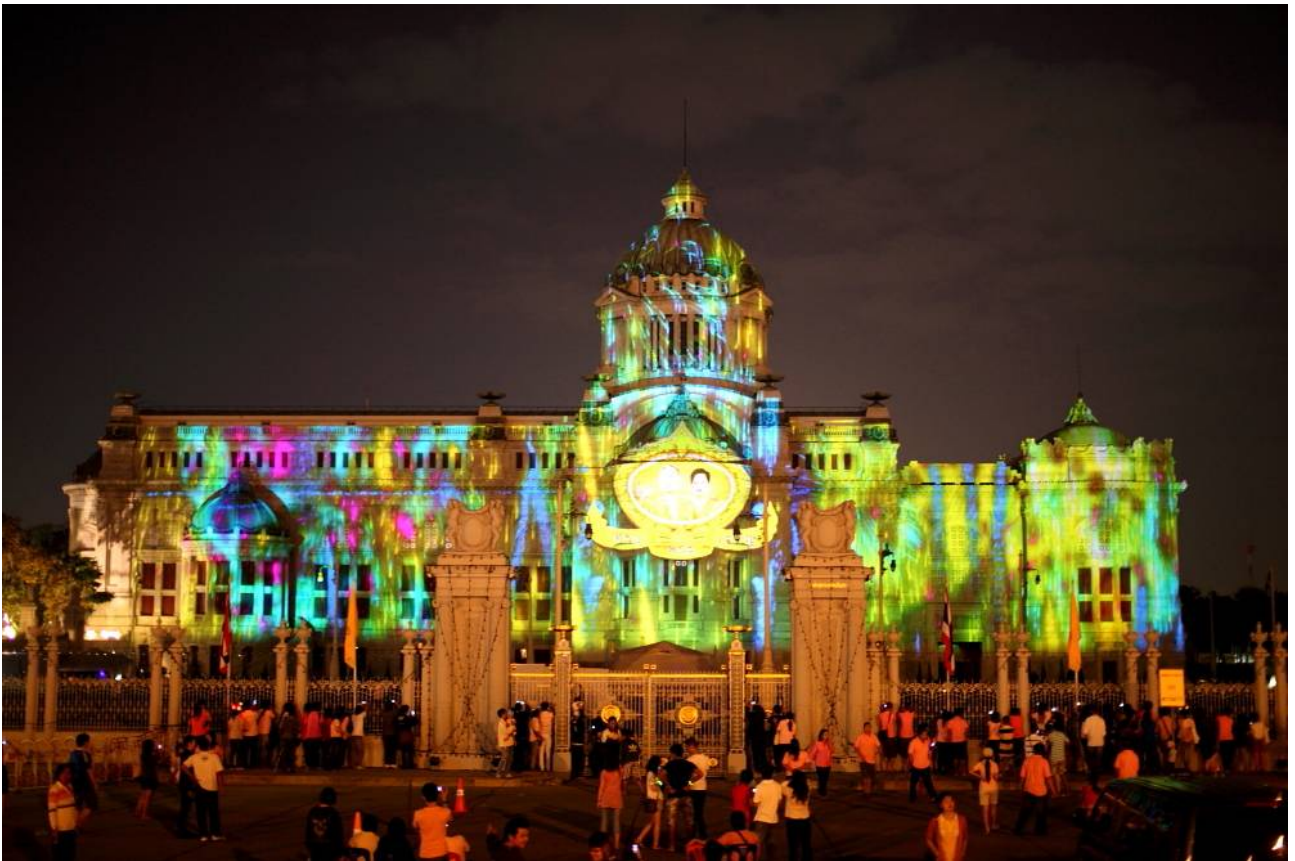
© 2009 VG Bild-Kunst Bonn Philipp Geist