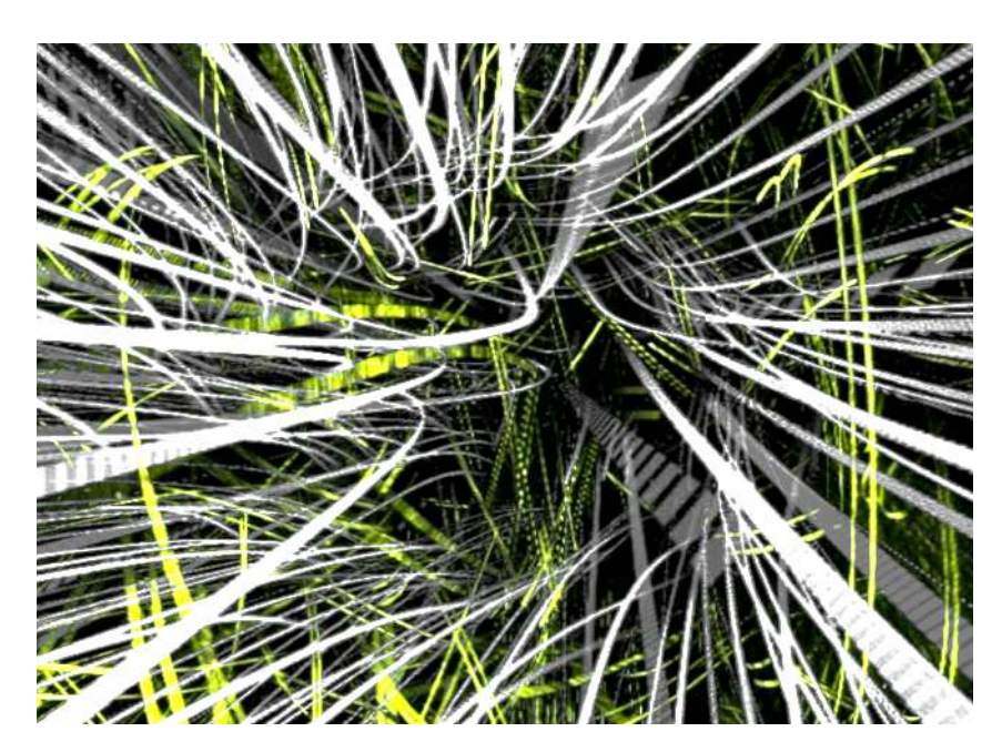
Videostill 2007, Lightbox 60x80 cm, Ed. 5+2AP

Geometrical, spatial forms like squares, cubes, perforated planes, lines and rays, overlay each other in an on-going process and build up a complete picture in order to dissolve it right away. The various elements create a complex architecture of images which is always in flux.